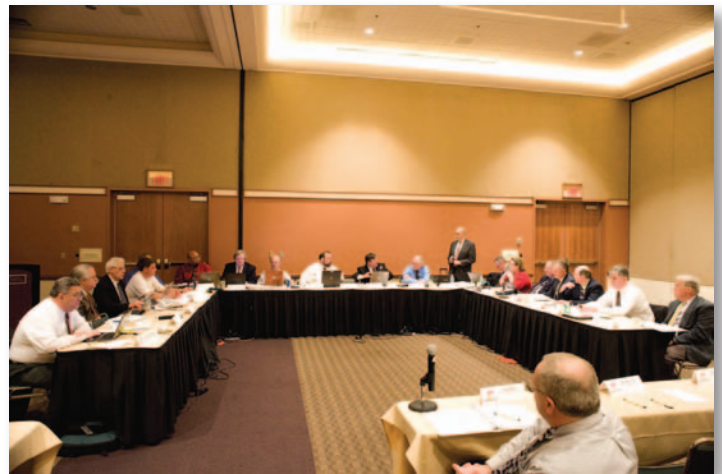
Governing Board in Session

Please join us at our next meeting at the Crystal Gateway, Arlington, Virginia, on June 16-18, 2008.