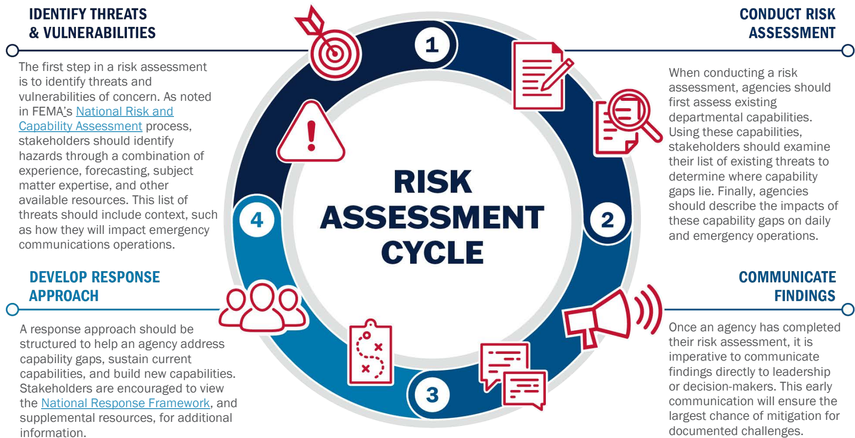
Figure B-1: Risk Assessment Cycle and Steps

This appendix provides an expanded Risk Assessment Cycle, as noted in Figure B-1 and described in the Risk Analysis section of this document.