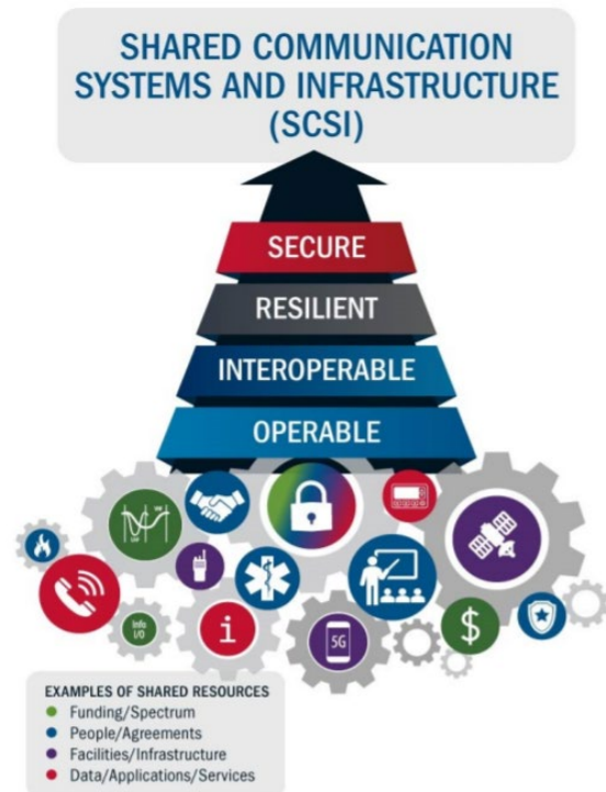
Figure 7: SCSI Approach Overview

In addition, officials should consider using lessons learned from periods of budget instability to request investments in interoperability solutions. Highlighting ongoing issues caused by a lack of equipment funding, public safety agencies can advocate for one-time purchases that may mitigate continued challenges. For example, one-off identity, credential, and access management advancements, standards-based compliance (e.g., Project 25, Long-Term Evolution), or encryption purchases may be vital to ensuring reliable, secure, and interoperable emergency communications during future periods of financial stress.