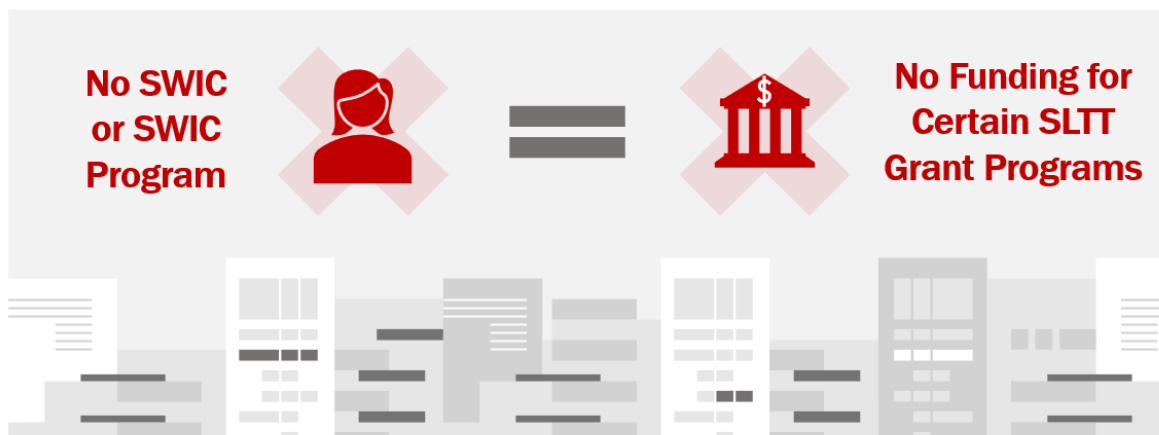
Figure 3: Grant Eligibility and SWICs