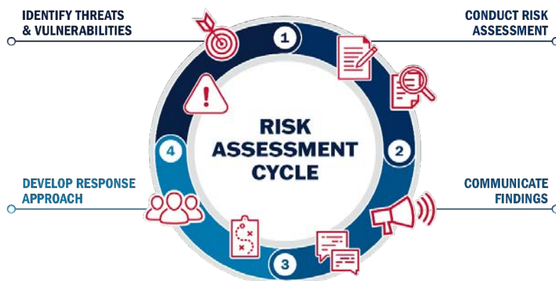
Figure 1: Risk Analysis Process

The first step to conducting a successful risk analysis is identifying the specific challenges that a public safety agency is facing or may eventually face. Understanding that these hazards vary across jurisdictions, stakeholders are encouraged to use state, local, and regional resources to determine their most pressing threats and vulnerabilities. For more information, reference the Available Resources section of this guide.